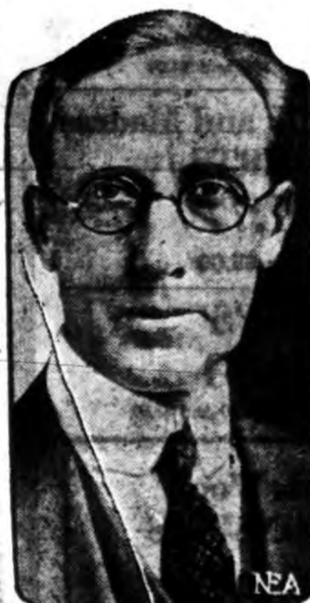
Oklahoma now is under the leadership of this man, Henry S. Johnson. He has just been sworn in as governor.